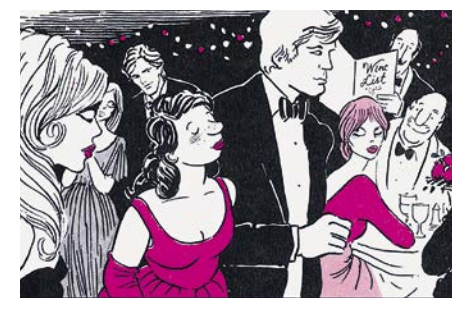
«True Love», 1981