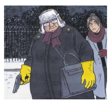
«Cassandra Darke», 2018